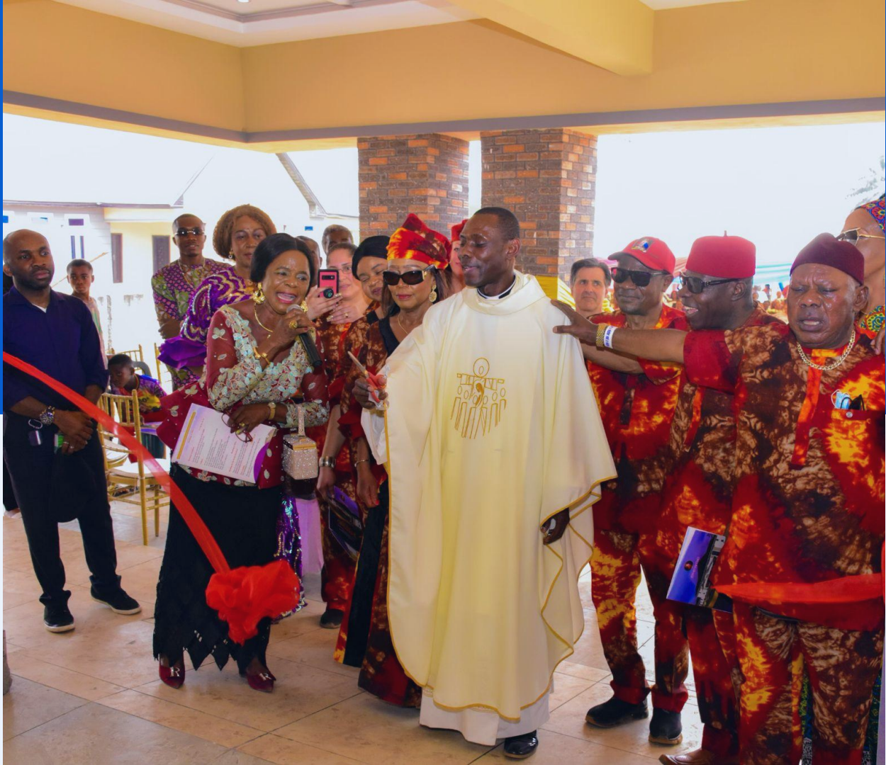
Divine Mercy Medical Center Ribbon Cutting January, 2023